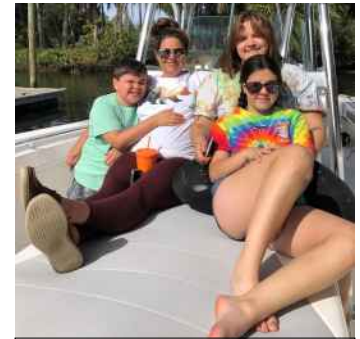
Family trip to Crystal River