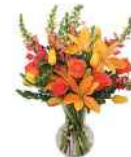
BLOOMING AT DAWN

The Small Business Profile is FREE and open to small businesses located in Marion County with less than 25 employees or solo entrepreneurs.