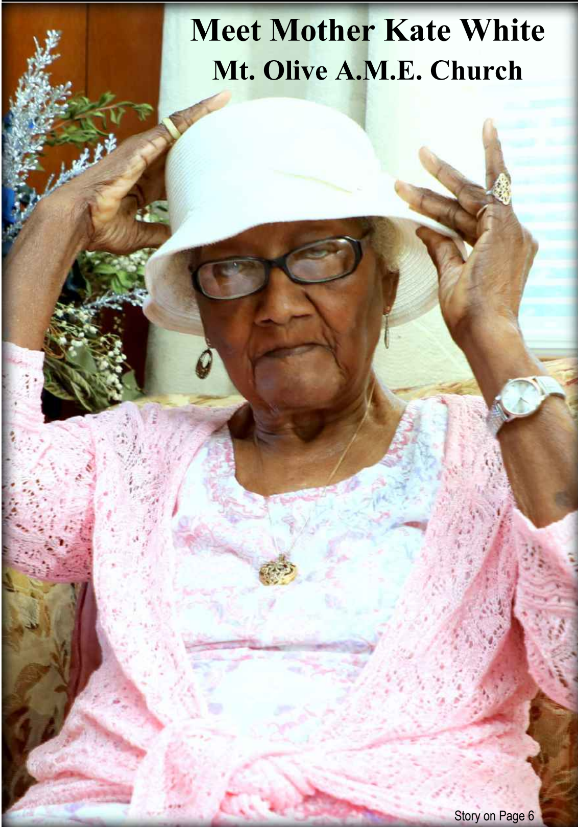
Story on Page 6