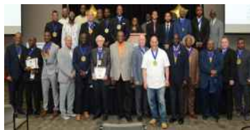
Superman Awards Ceremony

The organization meets periodically throughout the year and offers mentoring to youth, self-defense classes and self-development workshops and seminars for men and women. They assist individuals with personal goals and in the future, plan to help with career goals. During the holiday season, the organization assists homeless and low-income families with food and personal hygiene items. Long-term, the goal is to provide scholarships and grants to women and men who want to go back to school or start a small business and provide scholarship opportunities for teens who want to further their education by going to college.