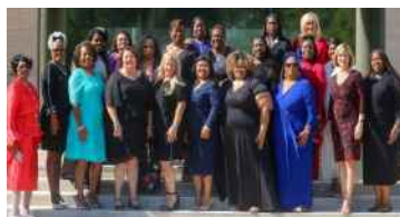
Superwoman Awards Ceremony

The greatest challenge the organization needs to overcome right now is realizing that they can't help everybody, but they can contribute and connect people to the right resources in the community through partnerships which are vital to helping reach the entire community in one way or another. She said the organization hosts three large events annually: The Superkids Awards will be held in August 2022 and the Superman and Superwoman Awards will be combined this year and held October 22, at the College of Central Florida.