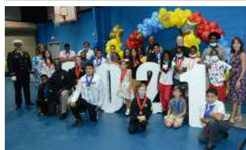
Superkids Awards Ceremony