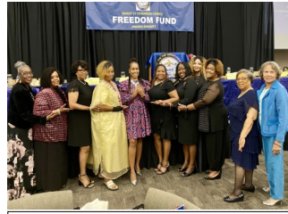
Community Service Uplift Ocala Alumnae Chapter Delta Sigma Theta Sorority, Inc.