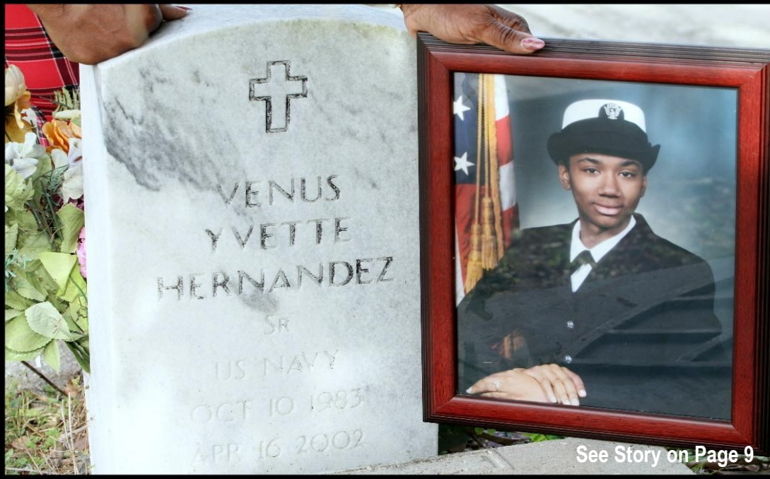
See Story on Page 9