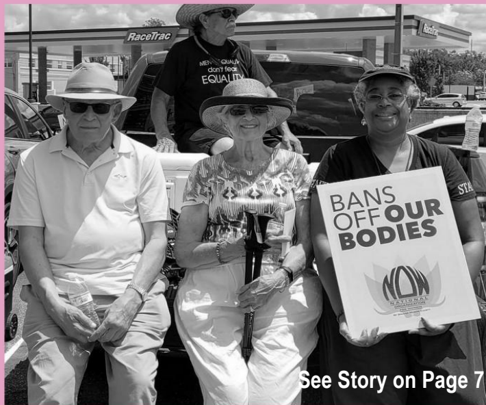
See Story on Page 7