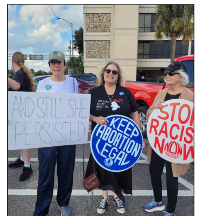
"Bigger than Roe" Demonstration January 22, 2023

For more information, visit their website at https://nowofgmc.org or follow them on Facebook at https://www.facebook.com/nowofgreatermarioncounty .